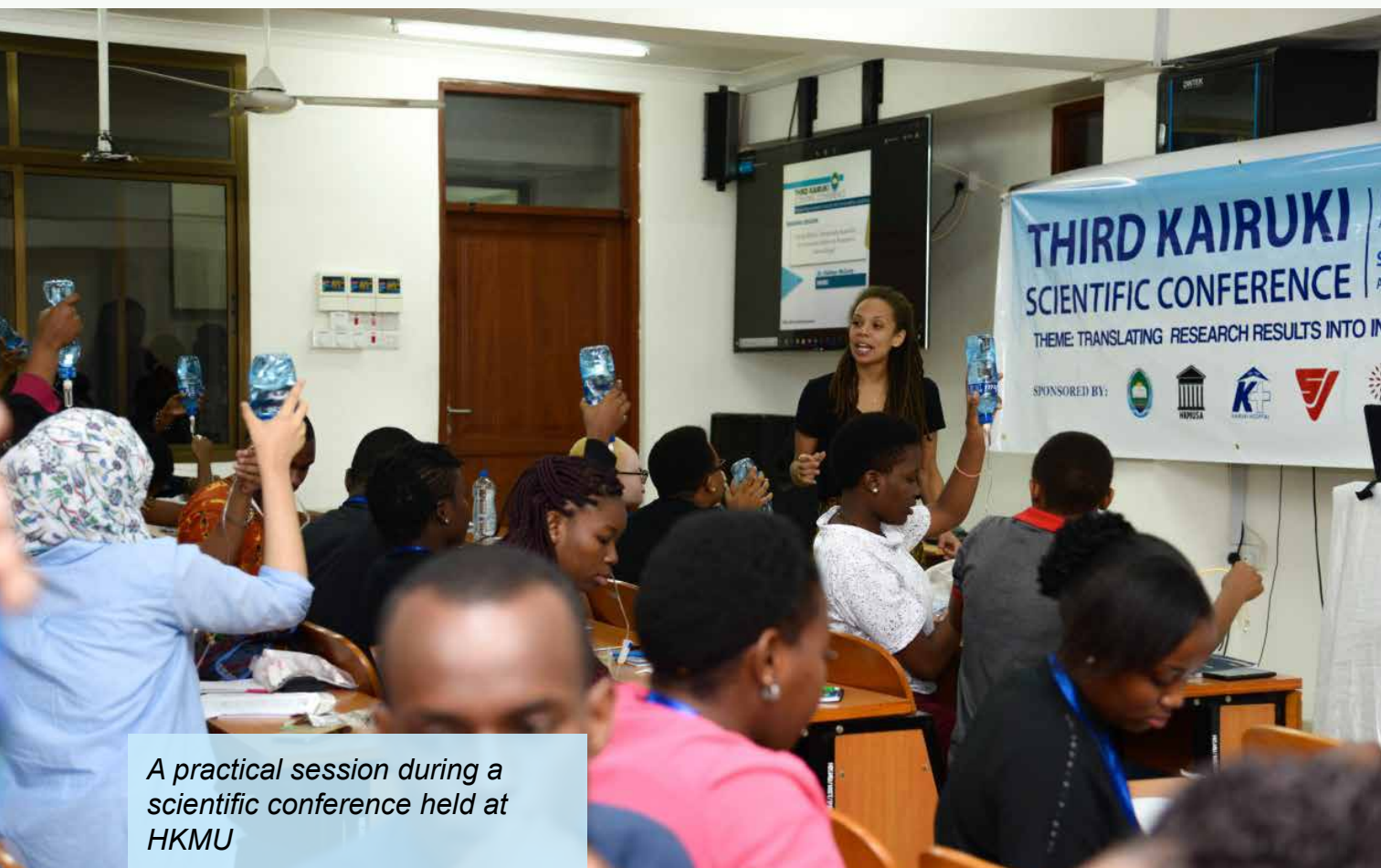
A practical session during a scientific conference held at HKMU