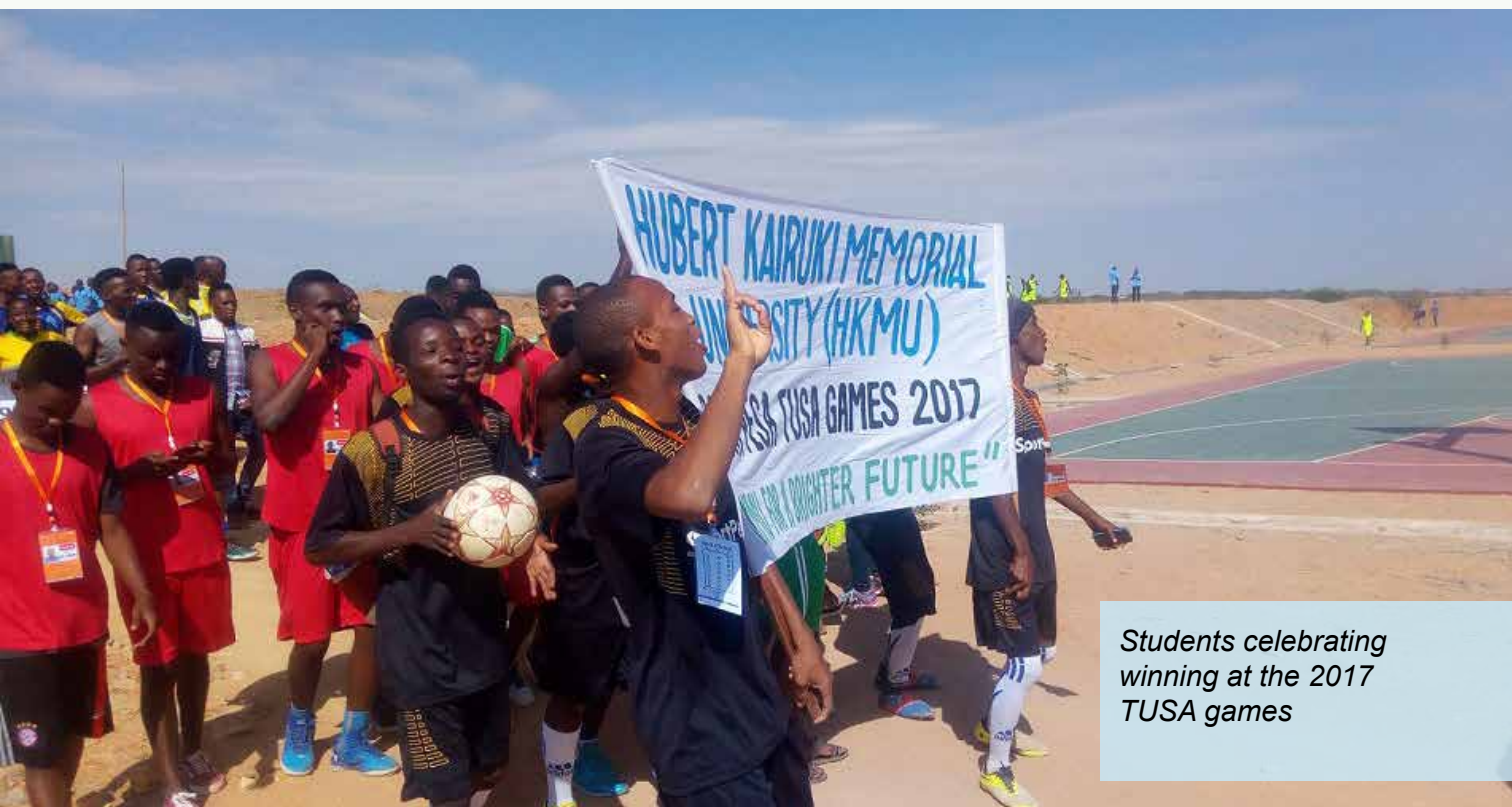
Students celebrating winning at the 2017 TUSA games

HKMU participated on the Tanzania University Sports Association (TUSA) Games, held at the University of Dodoma from 13-21 December 2017. Games competed for were football, swimming, basketball, volleyball, table tennis, high jump, running and pool table. HKMU got 17 medals and 2 trophies.