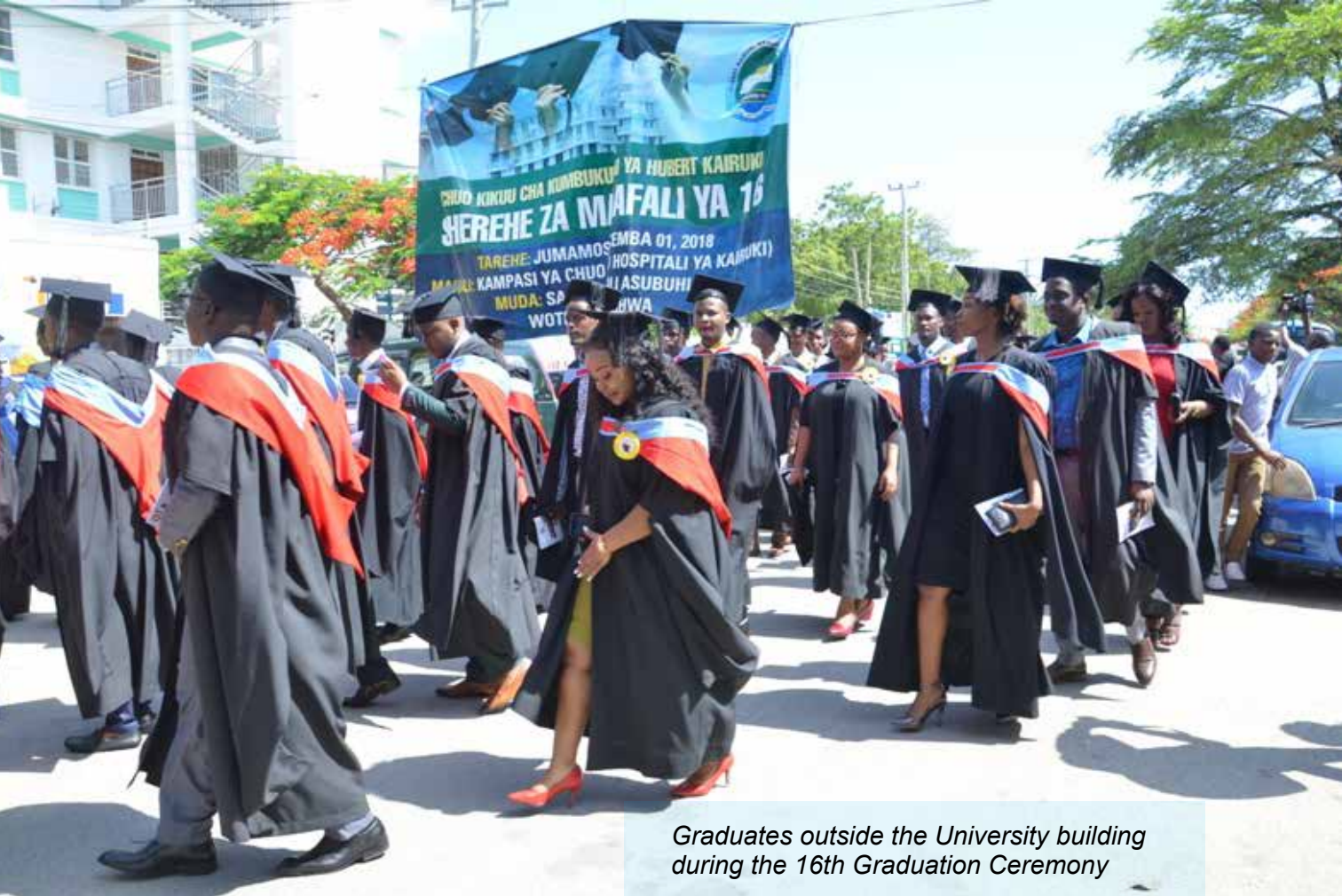
Graduates outside the University building during the 16th Graduation Ceremony