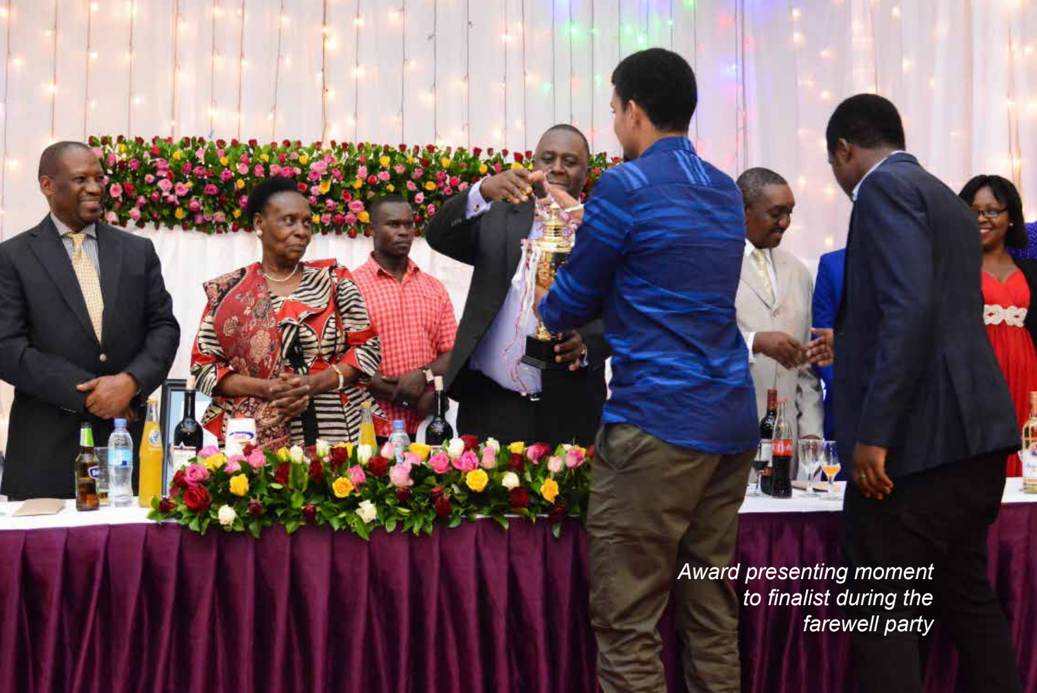
Award presenting moment to finalist during the farewell party